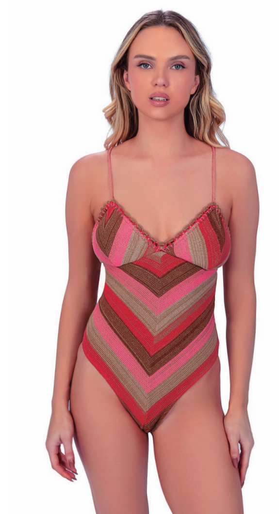
ZEN OP S/M/L/XL

TOP - 26323T WHSP - $ 39.00 / SRP - $ 90.00 BOTTOM BB - 26323BB WHSP - $ 39.00 / SRP - $ 90.00 BOTTOM BF - 26323BF WHSP - $ 39.00 / SRP - $ 90.00