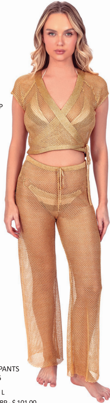
METALLIC PANTS 26176

S / M / L WHSP - $ 44.00 / SRP - $ 101.00