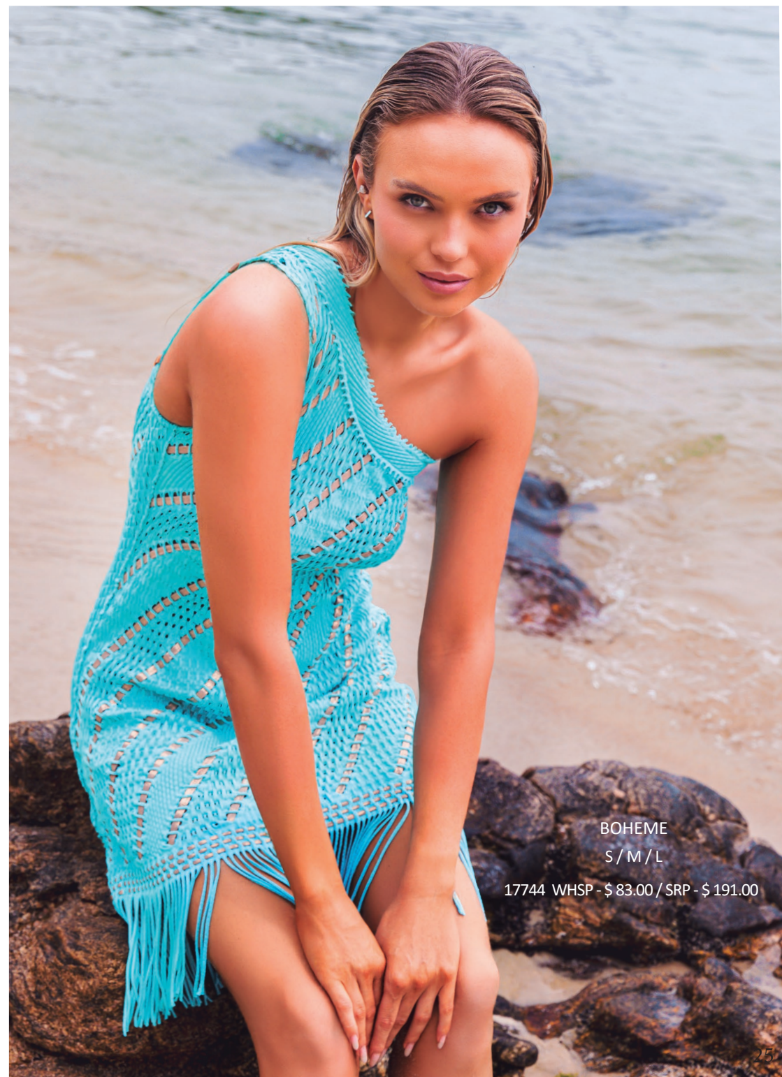
BOHEME S / M / L

BOTTOM BB - 17745BB WHSP - $ 81.00 / SRP - $ 186.00 BOTTOM BF - 17745BF WHSP - $ 81.00 / SRP - $ 186.00