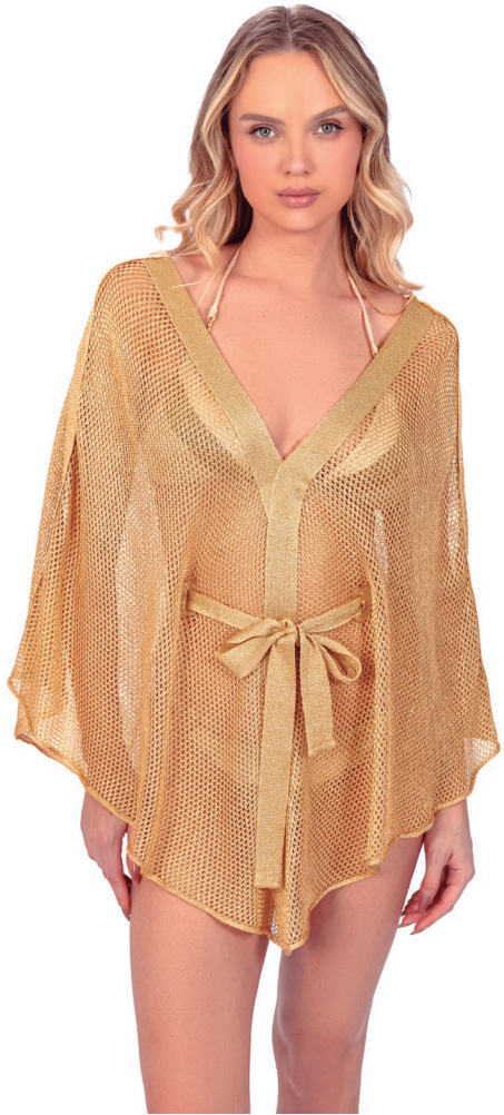
GOLD LIKE KAFTAN S / M / L