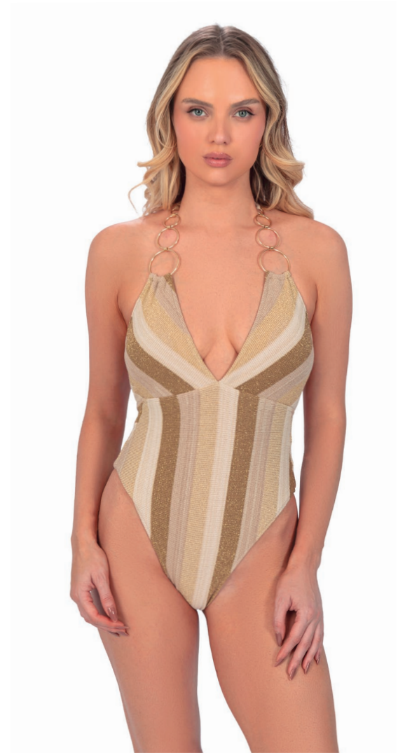
LINKED RINGS OP S/M/L/XL

TOP - 25437T WHSP - $ 43.00 / SRP - $ 99.00 BOTTOM BB - 25437BB WHSP - $ 43.00 / SRP - $ 99.00 BOTTOM BF - 25437BF WHSP - $ 43.00 / SRP - $ 99.00