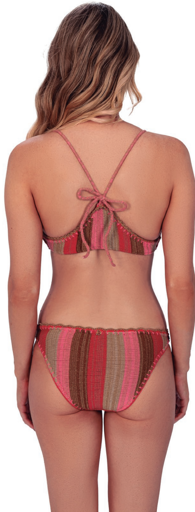
GRACE S / M / L / XL

TOP - 26325T WHSP - $ 40.00 / SRP - $ 92.00 BOTTOM BB - 26325BB WHSP - $ 40.00 / SRP - $ 92.00 BOTTOM BF - 26325BF WHSP - $ 40.00 / SRP - $ 92.00