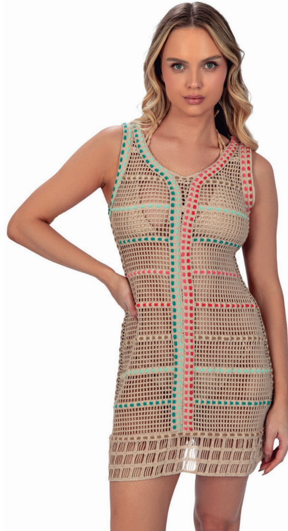
SIESTA S / M / L 26334 WHSP - $ 82.00 / SRP - $ 189.00

TOP - 26325T WHSP - $ 40.00 / SRP - $ 92.00 BOTTOM BB - 26325BB WHSP - $ 40.00 / SRP - $ 92.00 BOTTOM BF - 26325BF WHSP - $ 40.00 / SRP - $ 92.00